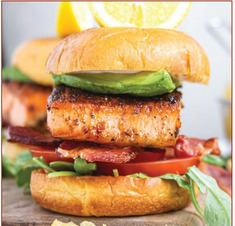
Fried, Crispy Salmon BLT Sandwich with Creamy, Sriracha, Sweet Chili Sauce