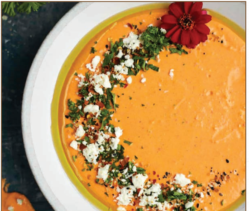
Warm Olive Tapenade Red Bell Pepper Dip with Feta and Basil Pesto