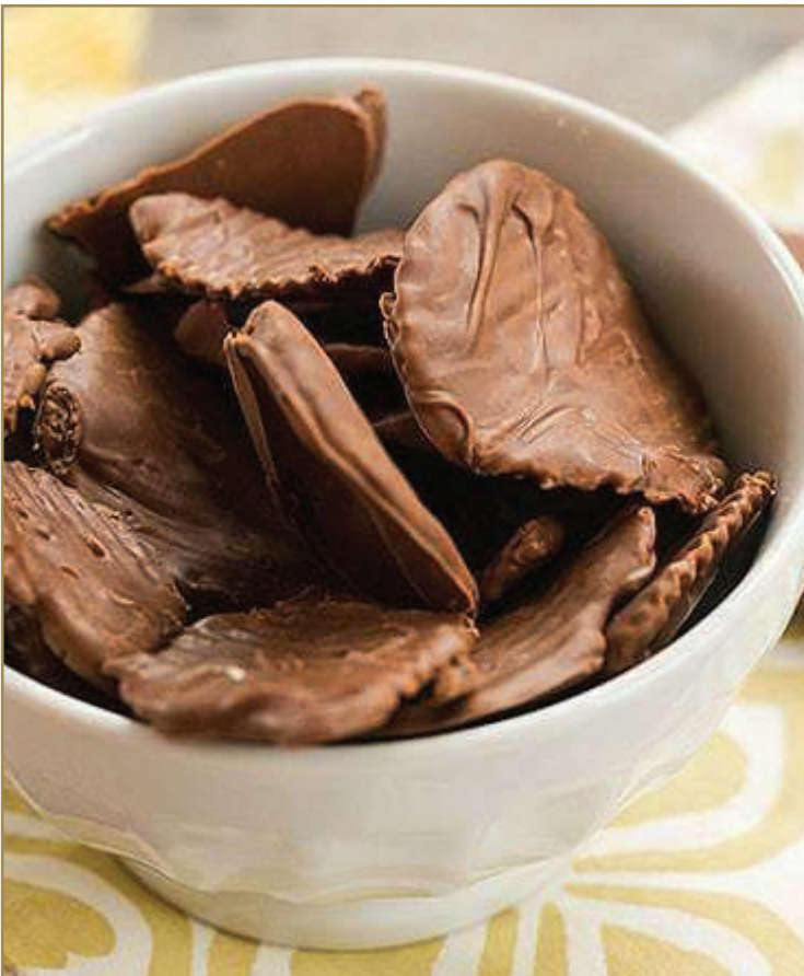
Chocolate Covered Potato Chips with Blue Cheese Dip